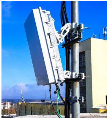
SAMPLE NEW 5G 'M' BOXES.

NOW, THERE CAN BE 232 NEW 5G 'M' BOXES MOUNTED IN YOUR ZIP CODE AREA ALONE ( MUCH CLOSER TO YOUR FAMILY !).