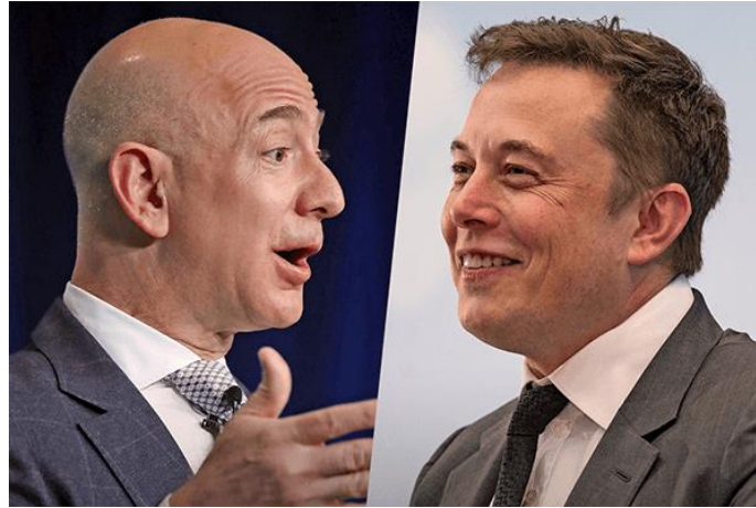
JEFF BEZOS & ELON MUSK

TWO WEALTHY BILLIONAIRES , (WITH A COMBINED WEALTH OF $180 BILLION )